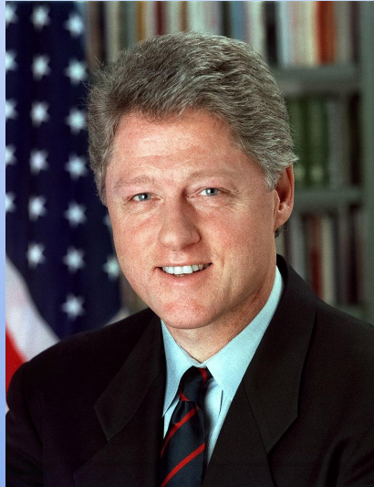
Bill Clinton 42nd President