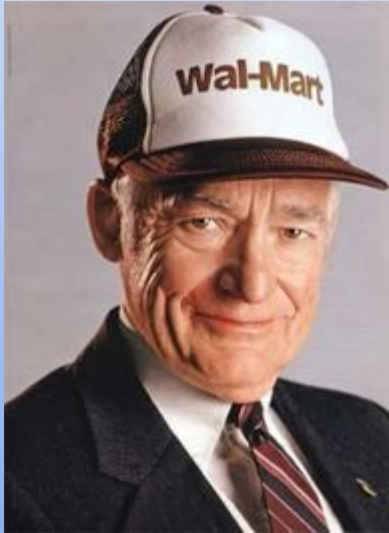
Sam Walton Created Walmart