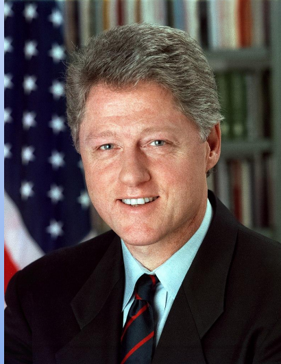
Bill Clinton 42nd President