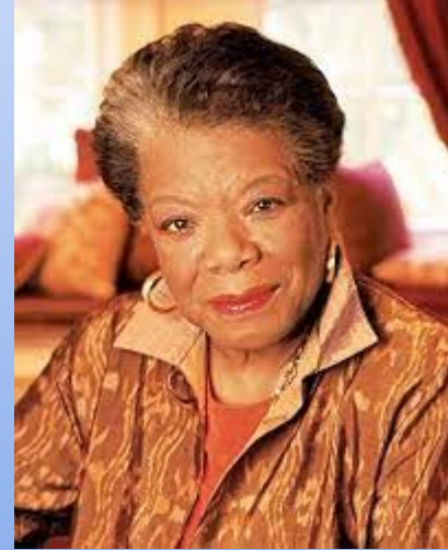
Maya Angelou Poet