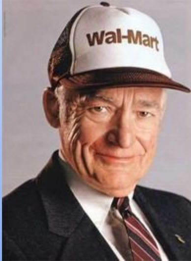
Sam Walton Created Walmart